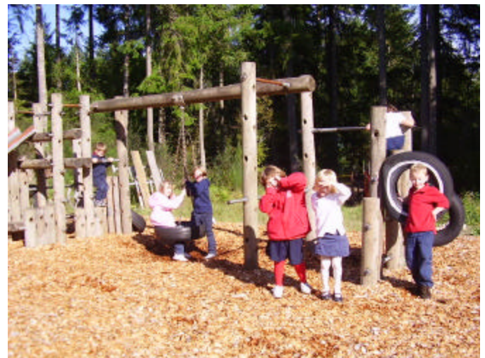
Our new play structure

Our first school-wide field trip took us to Theler Community Center and Wetland Trails. The Lower Hood Canal and Union River Estuary is the home to a wide variety of wildlife, including many endangered species. The trails in Mary E. Theler Wetlands take walkers through fresh and saltwater marshes teeming with plants and animals.